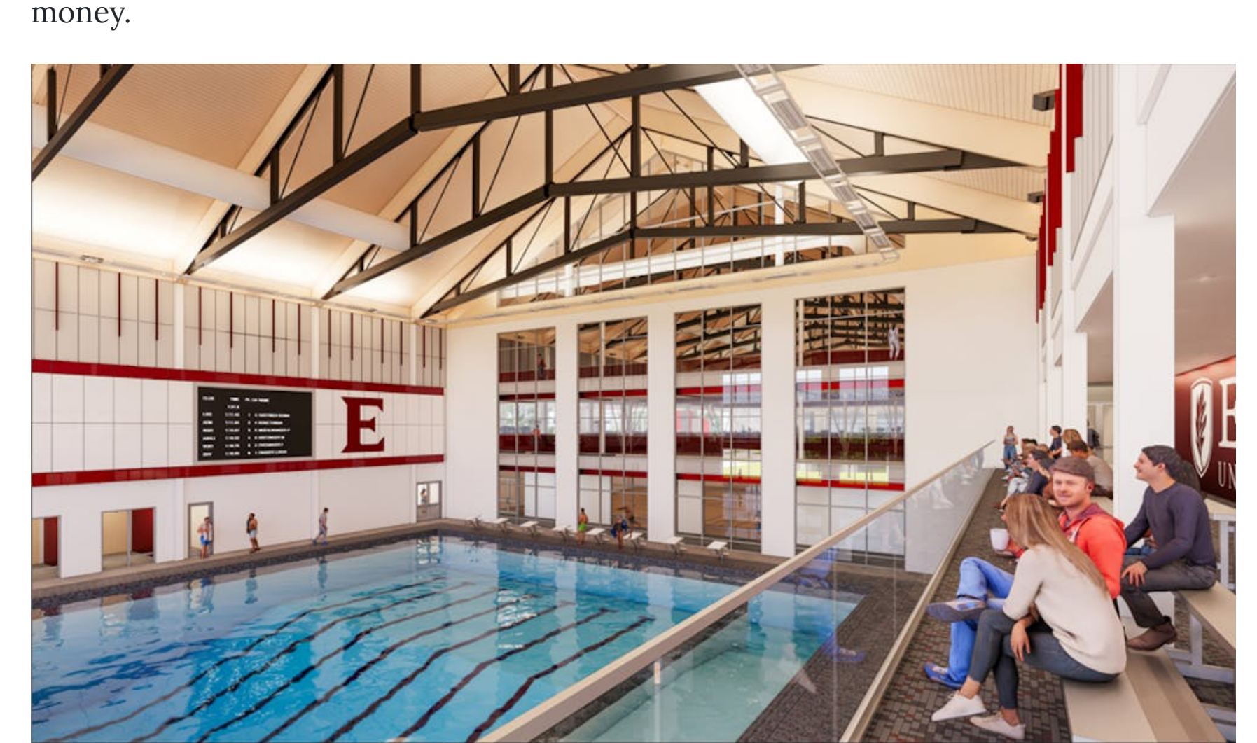
A rendering of the future HealthEU building showcasing the athletic center and rock wall. The building will be an open concept, incorporating each dimension of HealthEU throughout the building.

The dimensions of HealthEU — community, emotional, financial, purpose, physical, and social well-being — are all getting incorporated into the new space. Räisänen said each of the dimensions will be included in the building: Physical well-being spaces will include the new pool area, rock climbing wall, athletic center and healthy eating spaces like the demonstration kitchen; emotional well-being spaces getting added to the building include the new counseling services and meditation spaces; financial well-being is being incorporated through educational programs, but also the building will be a space where students can spend time together without having to spend